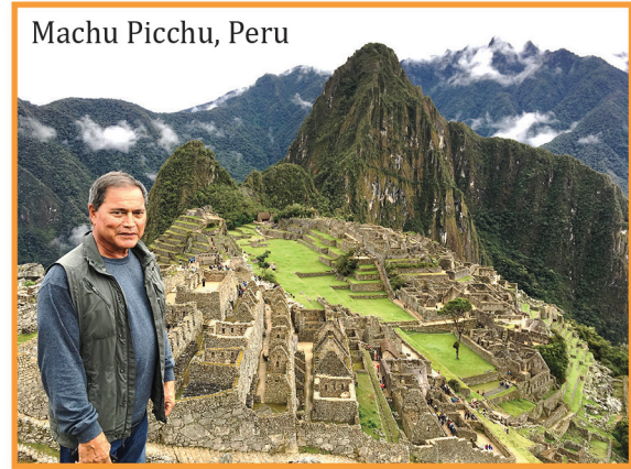
Machu Picchu, Peru

Do you have our newest resource? Visit our bookstore at GraceLife.org .