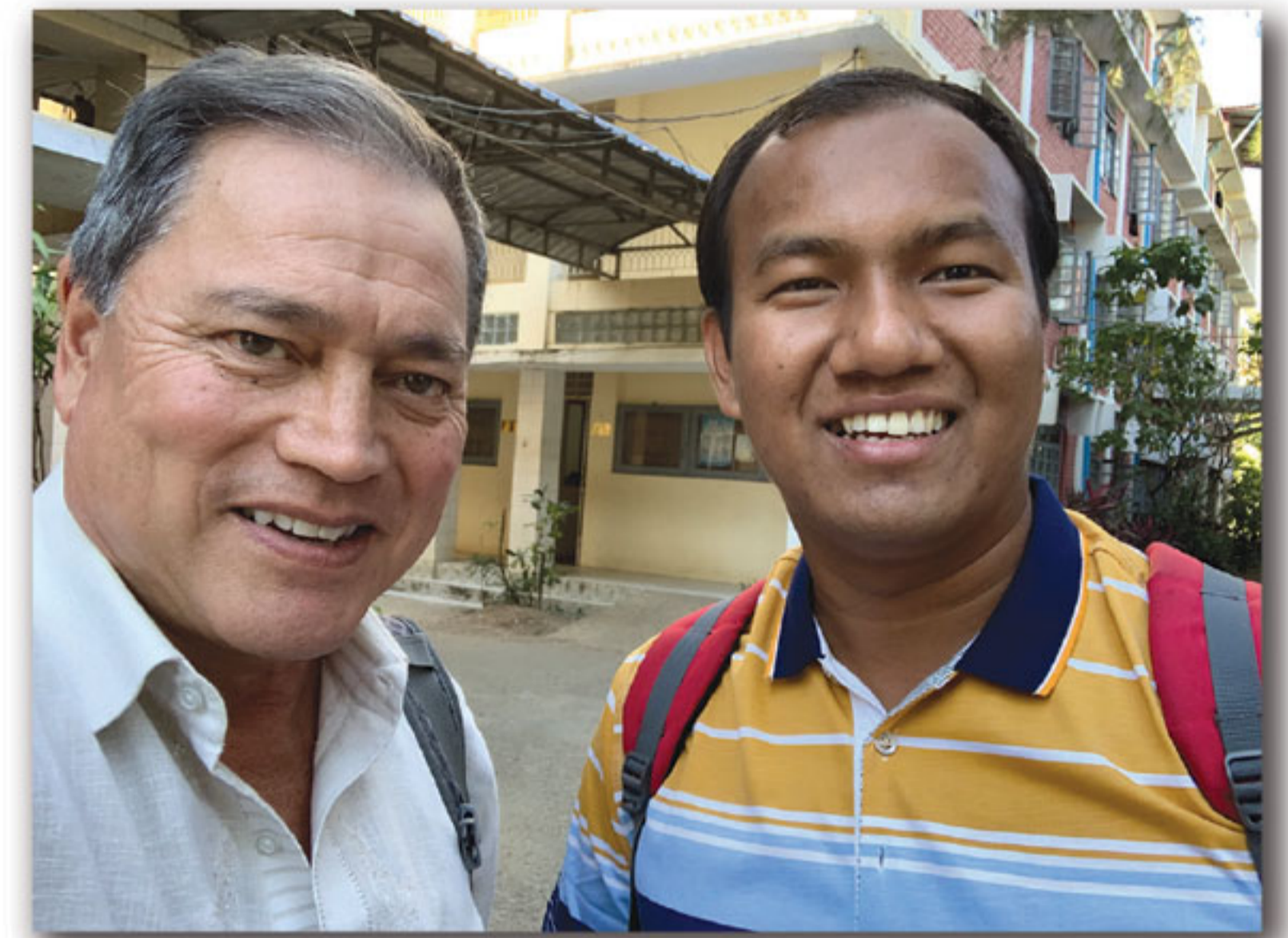
With a Myanmar Pastor

Note: GraceLife Institute is our program for training pastors and church leaders in other countries. Our emphasis is grounding them in the message of grace and related Bible books and theology. A team of instructors teaches three courses each year for four years. After taking twelve courses, graduates get a certificate.