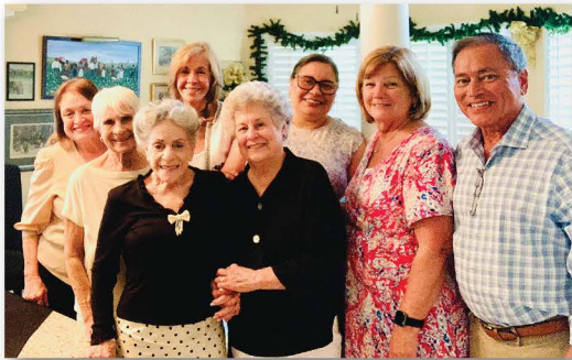
With the lovely Ladies from Bayside Community Church, Tampa