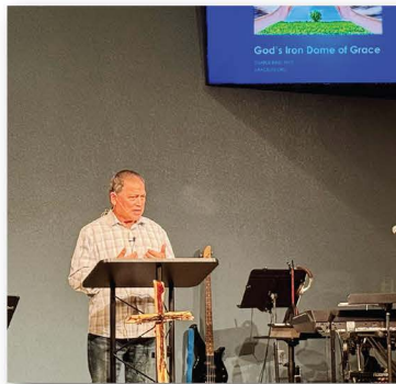
Monthly online teaching of pastors in India.