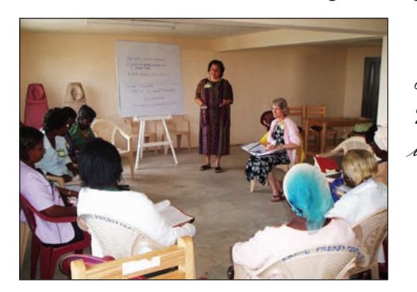
'The Ladies' Group has been very good to me, I mean the teaching was good – very clear and understandable.

l just want to say thanks to all the wonderful churches that made all this possible and also for thinking about us. The materials given were so so good. God richly bless you.