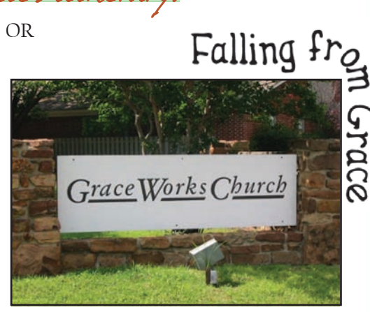
Huh? Email your best caption and you could win a free EvangeCube! (see page 2)

Sept. 23 - Westcliff Bible Church, Amarillo, TX Sept. 24-25 - IFCA Conference, Amarillo, TX Oct. 21-24 - Emmanuel Baptist Church, Starksville, MS