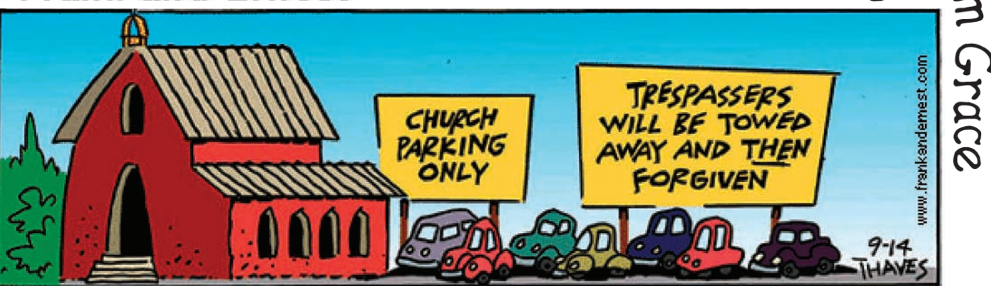
© by Thaves. Distributed from www.thecomics.com. Used by permission.