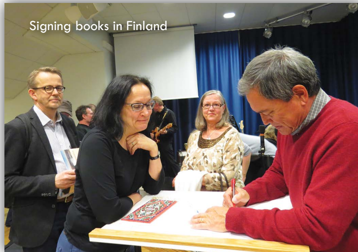
Signing books in Finland