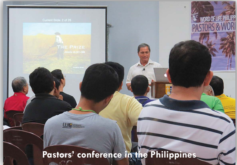
Pastors' conference in the Philippines

You can see and download the Gospel Survey from GraceLife.org under the "Resources" menu.