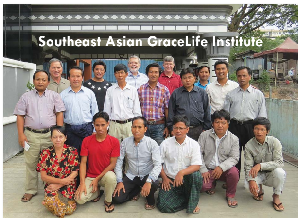
Southeast Asian GraceLife Institute