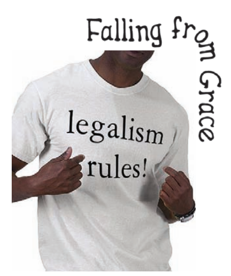
Huh? "For you are not under law but under grace" Romans 6:14